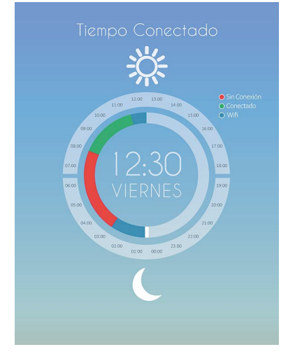
Figure 2: Connection time (offline/ online/Wi-Fi) in the afternoon (12:30).

Figure 1: Adkintun Mobile signal quality (4G) in the morning (7:00).