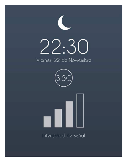
Figure 4: Signal quality (3.5G) at night (22:30).

Figure 3: Connection type (GPRS, Edge, 3G, etc.) in the evening (18:30).