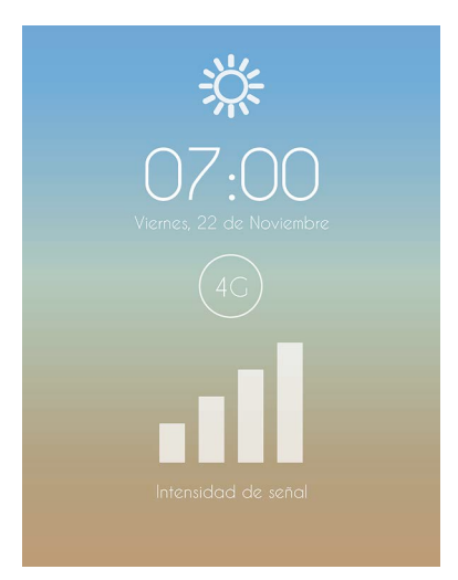
Figure 1: Adkintun Mobile signal quality (4G) in the morning (7:00).