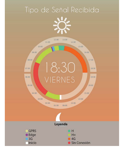
Figure 3: Connection type (GPRS, Edge, 3G, etc.) in the evening (18:30).