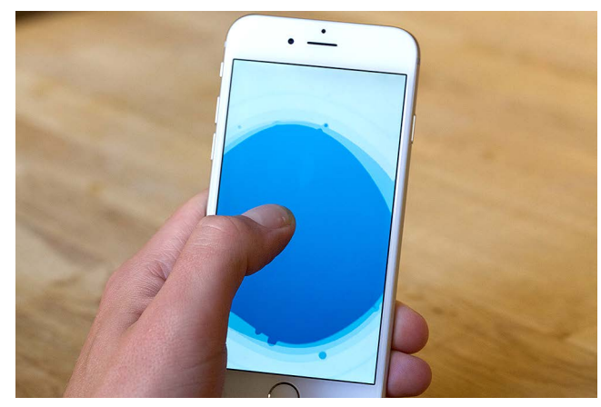
Figure 1. The PAUSE App with graphics as seen after an extended period of mindful touch.

The rest of this paper is structured as follows. We begin by reviewing the relevant related work and the notion of interaction styles. Then, we describe the iterative design of PAUSE in detail. Finally, we report the results of the initial evaluation, followed by discussion and conclusions.