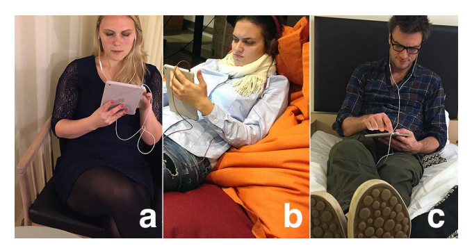
Figure 5. Evaluation Setup. Participants trying out the PAUSE app while: a) sitting in a chair, b) lounging on a Fatboy, and c) lying in bed.