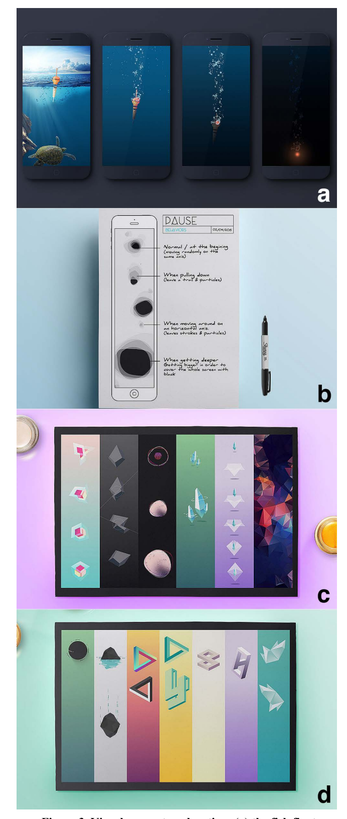
Figure 3. Visual concept exploration: (a) the fish float concept, (b) soft sinking object, (c) floating shape ideas, and (d) Escher's impossible shapes.

We started out with a realistic design visualizing a fishing float that dives deeper into the ocean in accordance with the person's stroking movements (Figure 3a). Although engaging and beautiful, there were some pieces that did not fit. It felt heavy, whereas it should have been airy, made of subtle nuances, which adds the scent of mystery that usually surrounds meditation. Also, the colors were garish when we needed them to be soft and silky.