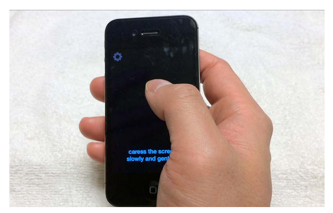
Figure 2. A slow, gentle and continuous interaction mechanism creates meaning for the act of voluntarily paying attention. In this first working prototype, gently moving a finger on the screen triggers a soothing music.

We created a working prototype of this interaction mechanism with sound feedback only (Figure 2). The screen starts with a simple instruction to 'caress the screen slowly and gently' to help people get started. After that, the screen will turn completely dark to encourage people to close their eyes, as there is nothing to look at. Shutting off visual stimulation helps people in entering a calming state of mind. As the person starts moving their finger slowly, continuously and gently on the screen, a soothing music starts to play to acknowledge the person's presence at the moment, and to motivate the person to sustain the finger movement continuously for an extended period of time.