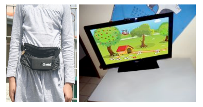
Figure 1. Student wearing a fanny pack with a mobile phone in it (left). Public display with motivational feedback (right).

In our line of work we attempt to build persuasive sociometric technologies, ones that sense children's social interactions in real-time, and provide persuasive, just-in-time recommendations to children with the goal of stimulating pro-social behaviors. This work is motivated by recent advances in sensor technology [6] and social network analysis techniques [19]. For instance, our prototype, BlueFriends , uses mobile phones that children wear around their waists (Figure 1, left), and which track pair-wise physical proximity of children during playtime. Using social network analysis techniques we are able to quantify the strength of ties between any two children, but also the presence (or isolation) of each child in the social network using network centrality metrics.