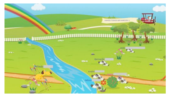
Figure 3. Public display visualization of the avatar of the primary child's avatar and those of the excluded group, separated by a river. Spending time with these children helps building a bridge so that all dogs can play together.