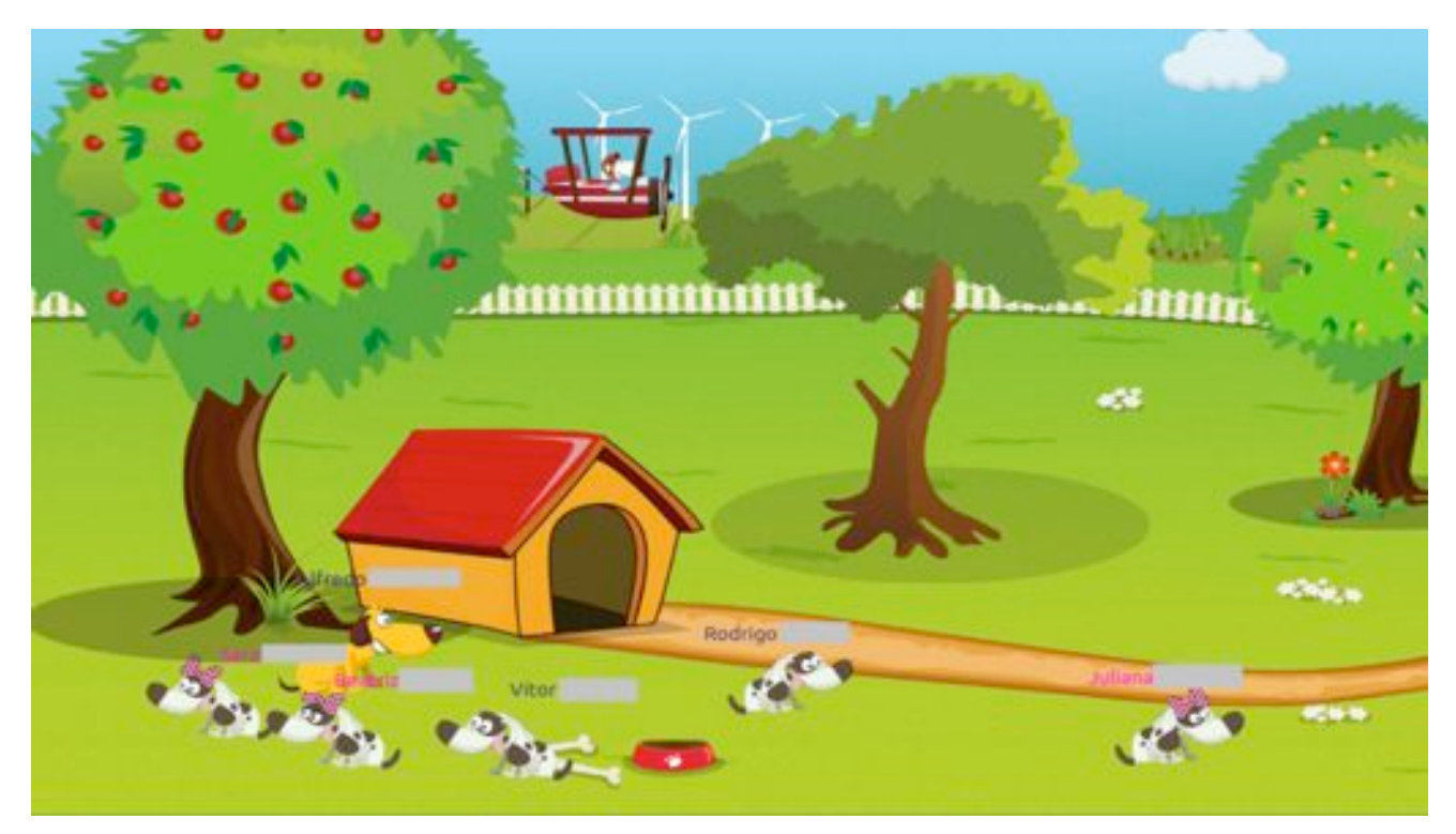
Figure 5. Public display visualization of the primary child's avatar along with his peers. The avatar of the child engages in free play with its best-buddies (i.e., the avatars of the children that he spends the most time with). An airplane on the background displays messages with contextualized feedback (see also fig 3.), helping children in interpreting the avatar's behaviors.

associated with the children that he or she has interacted the least. The child is informed that a bridge will be built and all dogs will be able to run together once he or she starts spending time together with the children represented in this second group of dogs. The level of interaction that a child has with these (weak-tie) children influences the mood of this second group of dogs. Dogs express their feelings in two ways: a) physical activity, where high physical activity reflects positive mood, and b) facial expressions that reflect happiness, apathy and sadness (Figure 4). Through these two visualizations, we wanted to induce reflection on children regarding the negative consequences of their exclusionary behaviors on other children's feelings, as well as highlight the positive impact of pro-social behaviors on the wellbeing of everyone in the community.