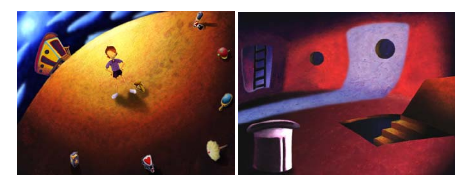
Fig. 3. Circus Interface (left). Objects scattered in a circle by Papelucho form the circus ring. Each object represents an act of the circus and one of the seven Multiple Intelligences. Circus Trailer Interface (right). Here children decide what activity they want to do by taking the ladder for reading, choosing the hat for writing or going down the hatchway for creating a product.

Circus Trailer Interface. This is a transit space where children have the chance to decide what kind of activity they want to do: Read , Write or Create a Product (Figure 3, right). Suggestive sentences invite children to the corresponding activities. By following the invitation "there is a " lettery " (starry) night!" children will use the Ladder that takes