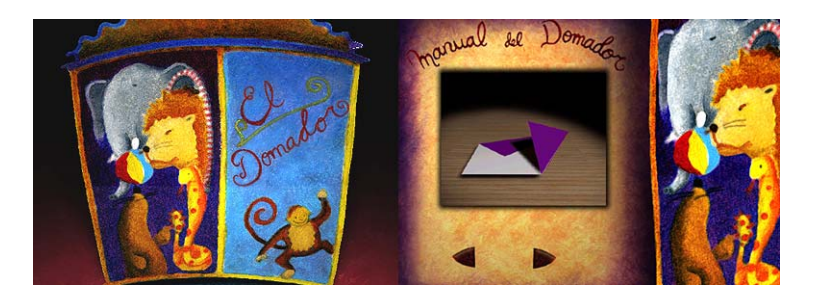
Fig. 6. Preparing the Act Interface. In this case, children first pick an animal (left) and then follow a step-by-step tutorial on how to build an Origami figure of the chosen animal (right).

Presenting the Final Act. Offering praise for completing a task or performing a given behavior can lead to staying on task longer and getting a better understanding of the material [2]. In this case, the kind of praise is not only a virtual praise but also praise in the real world. The origami figure has the exact appearance on screen as the paper-Origami animal children chose to build. In this way, children will easily relate the paper figure they have in their hands with the animal Papelucho is taming (Figure 7). The main reason for doing this strong link between virtual and real objects is because we want children to perceive a continuum between creating an origami figure with the assistance of the computer at school and creating origami at home with the help of printed material. Similarly, this continuum is created for reading. They can read one day in the life of Papelucho on the computer at school, but they can also take the book home and read it. Thus, the experience of the software is not limited to school or to having a computer.