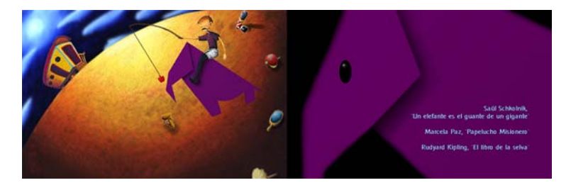
Fig. 7. Presenting the Final Act. Once students have built the paper-Origami animal, Papelucho performs the "Lion Tamer" act (left), offering children praise for building the animal. Next, a list of suggested books that children can find at school is presented (right).