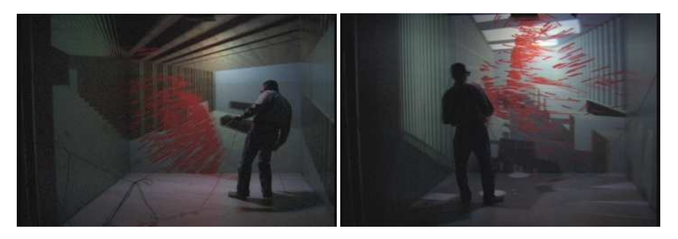
Figure 2: An immersive visualization of room acoustics. 800 particles, emitted from one source source are animated inside a photorealistic model of an auditorium and a library.